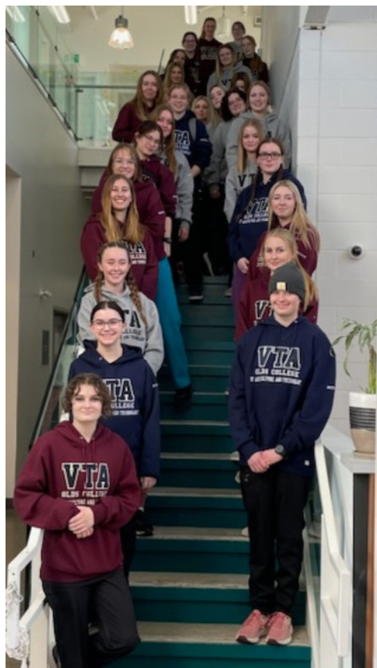
Veterinary Tech - dual credit students

The goal of dual credit is to provide students with skills and experience necessary to transition successfully to post-secondary learning for their career of choice learning. We want students to leave high school engaging in the career pathway that they are passionate about. About 490 Chinook's Edge students enrolled in dual credit this year.